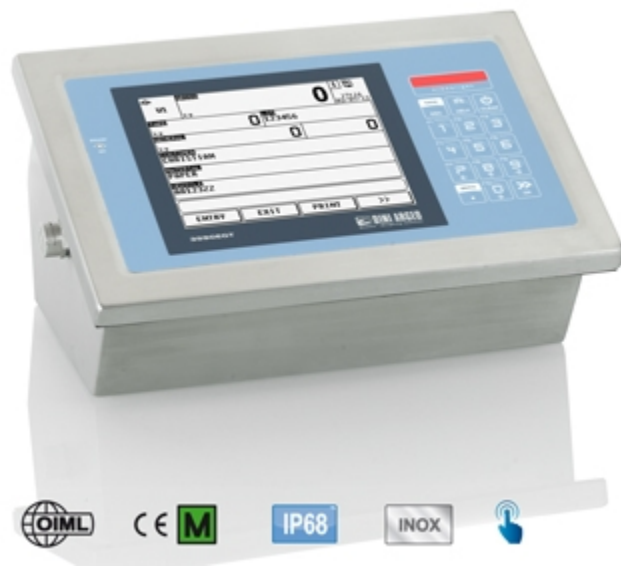
3590EGTXT01BC Stainless steel weight indicator with touch screen display.