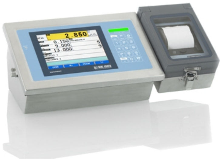
3590EGT with IP65 INOX printer